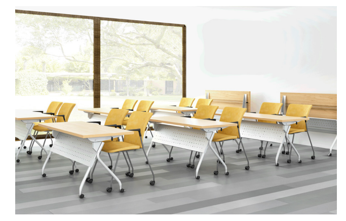
Flip & Nest Tables