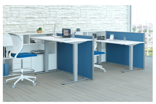
Height Adjustable Tables